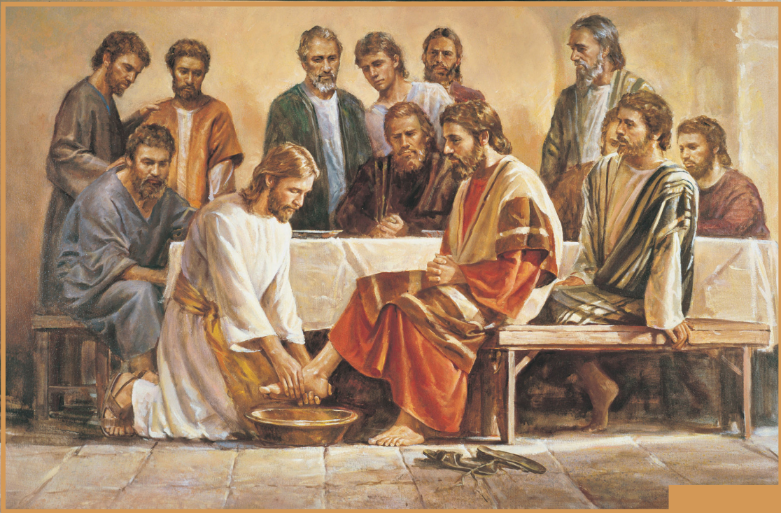
Jesus Washing the Feet of