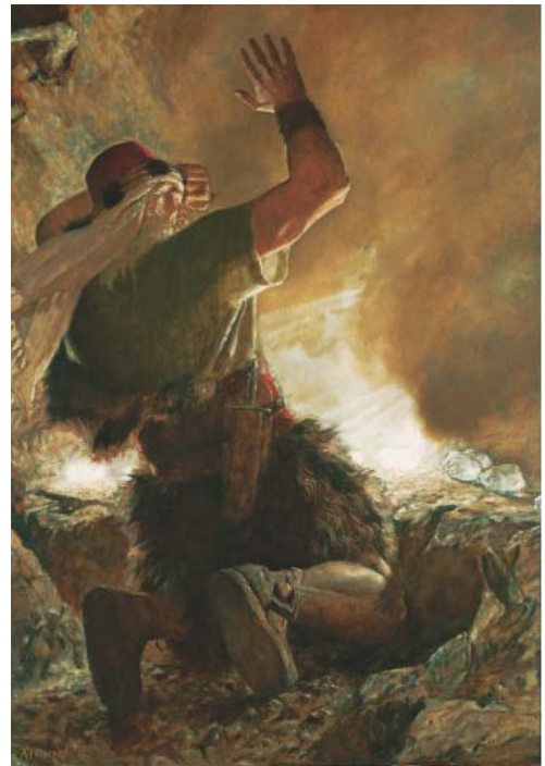
Illustration of a man kneeling in prayer, looking up at a bright light source in the sky. © 2012 LDS Church.

As you can see, having a binder filled with these things can make your calling easier. To maintain your book, look through it on a weekly basis, take out what is no longer needed and research any questions you have had, put items from the calendar on you family calendar, move current meeting minutes to history, add photographs or handouts to the appropriate places, and prepare or evaluate events and don't forget to index important information.