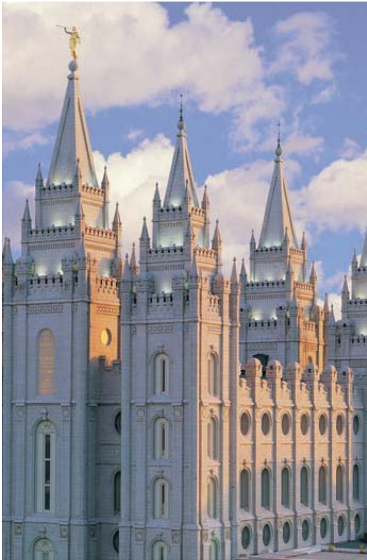
Salt Lake Temple, photo of temple © 1999, p

It was as a primary secretary that I first realized the importance of a working binder. I was in charge of 112 young children, their attendance in primary, their advancement to YM and YW, Cub Scouts and Achievement Days, their baptisms, talks, prayer and scriptures, their parts for the primary program, whether they have memorized their Articles of faith and their progress in the Faith in God program. That was just taking care of them. My other job responsibilities included meeting minutes primary itinerary each week, and so much more. In order to be effective in my calling and make sure that no one got left behind, that every child was considered and thought of each week, I needed a tool that could handle everything.